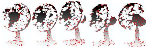
Fig. 4. Detected keypoint on fan model with SC_HK_connex, in view angle variation