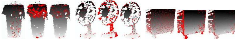
Fig. 3. Detected keypoints on trash can, fan and storage cupboard models with: SID in first column, SC_HK in second column and SC_HK_connex in third column.

To evaluate detector performance, we illustrate a visual comparison of keypoint positions detected with SC_HK, SC_HK_connex, and SID detectors as shown on figure 3. It reveals that the final selected points are quite well localized. The combining process allows a better feature point filtering than SC or HK alone, as false detected points in both are eliminated, and points with correct surface type remain. Figure 4 illustrates the relative stability of keypoint's positions detected with SC_HK_connex detector when varying viewpoints for the same object. Clearly, we recover almost same keypoint positions in the different views. For a quantitative analysis showing the superior repeatability of our keypoints, we refer the reader to our previous publication [13].