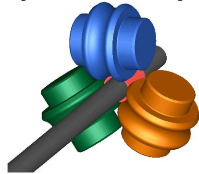
Figure 1. FEM simulation set-up.

Optimizing numerically the whole process with a long tube is simply not feasible at the time being, because of the huge computation time involved. Consequently, a short tube approach is used. A pilgering pass where deformation is close to 25% is simulated. The tube is turned 39° and moved forward (feed) 1.7 mm after each stroke. A material point takes 120 strokes to pass through the working zone. Initial position of the simulated systems is displayed in Figure 1. Lagrangian numerical sensors have been placed at the mid-length of the tube at different angles.