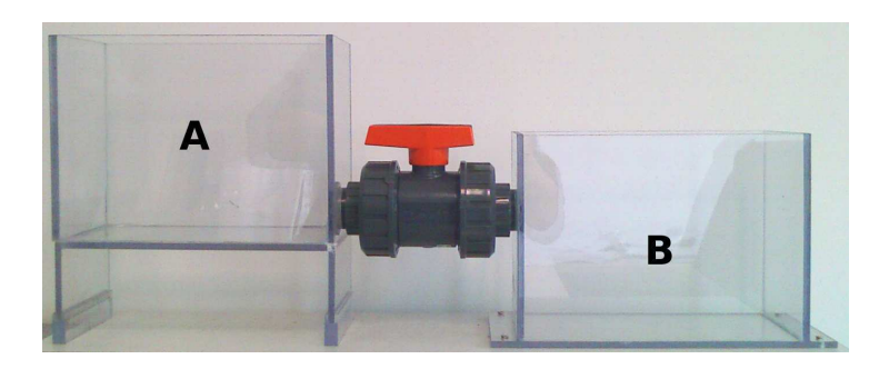
Figure 1: Experimental setup and illustrative picture

As a validation of a turbulent sharp interface method in three-dimensions, we consider a simple water filling between two communicated tanks as shown in figure 1. The first tank (A), full of water is elevated from tank (B) which is initially filled by air. The experiment starts when the flood gate between the tanks is opened. The stabilized finite element method is applied to solve both the incompressible Navier-Stokes and the transport equations.