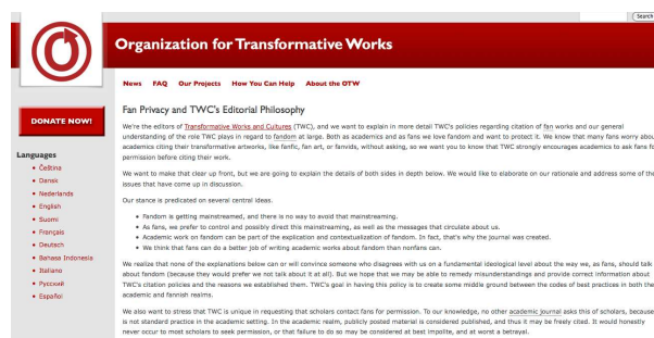
Figure 1. Author guidelines or editorial philosophy? (Screen cap, http://transformativeworks.org/projects/twc-citation. ) [View larger image.]

[2.4] While I was going through peer review and the prepublication process, I was directed by the journals' editors to an essay they had written for the Organization for Transformative Works: "Fan Privacy and TWC's Editorial Philosophy" (Hellekson and Busse 2009). The more I pondered it, the more I found myself thinking that the essay, in addition to outlining the rationale for the journal's editorial policies, was also proposing a conceptualization of acafandom by defining the right ways of doing things for an academic in the field of fan studies, and was doing so by reconfiguring the rules of engagement in what is commonly considered one of academia's essential practices: publication.