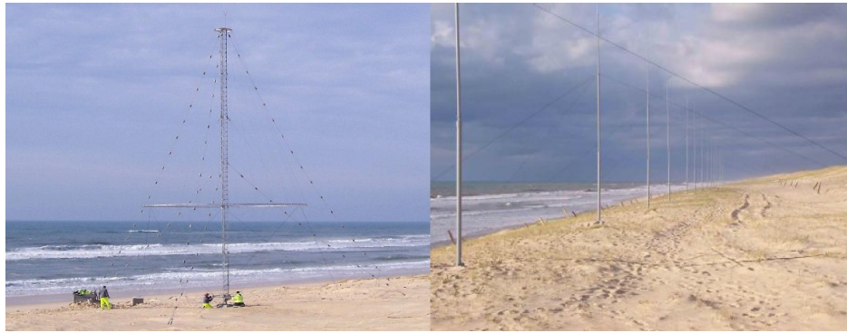
1.a) Transmitting antenna