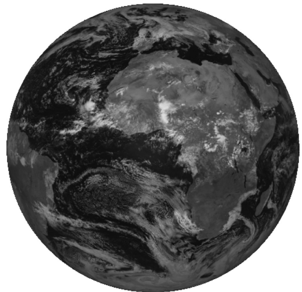
Figure 1. Example of a Meteosat SEVIRI (Spinning Enhanced Visible and InfraRed Imager) image in the visible channel, taken on September 7, 2010 at 1200 UTC. Reflectance increases from black to white.

The HelioClim (HC) project is an initiative of Mines ParisTech, the French school of engineers, and ARMINES,