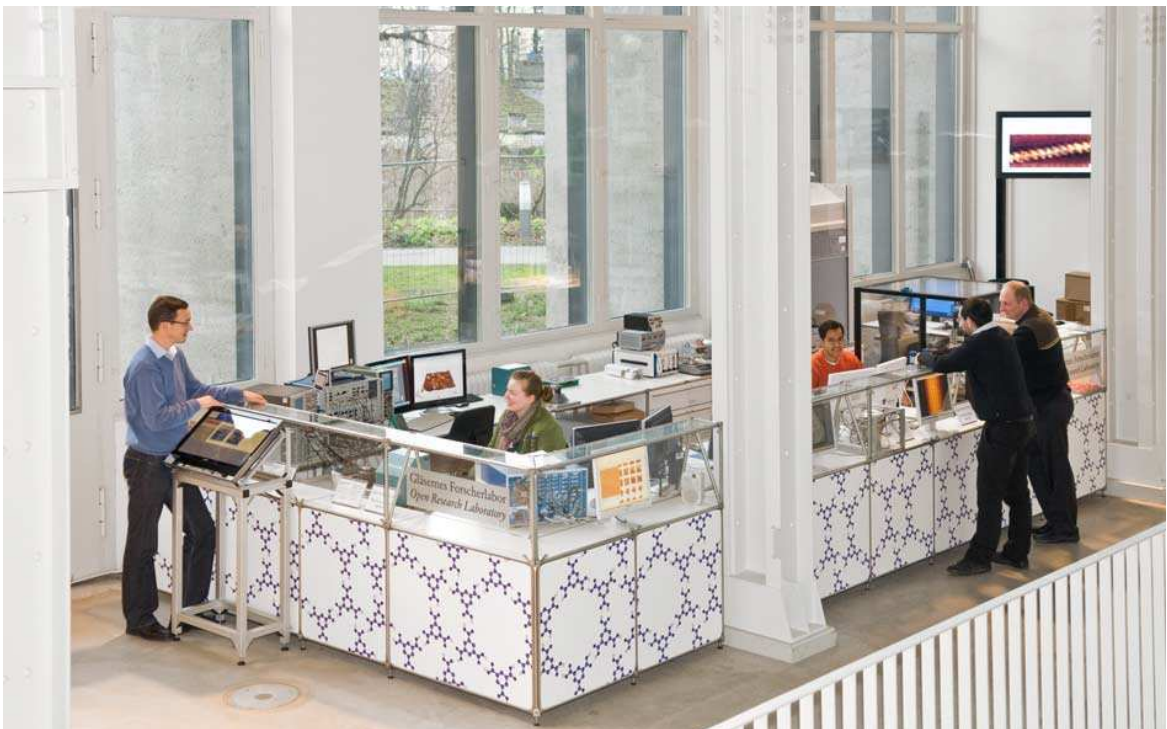
Figure 1. The open research laboratory ('Gläsernes Forscherlabor') at the Deutsches Museum (Photo: copyright Deutsches Museum).

only work for a limited time in the laboratory (i.e., 3–6 months); that career young people (PhDs up to postdocs) should work in the laboratory; that it should be a small research lab (with five to eight scientists); and that it should have a private entrance and a 'quiet room' for reading and holding meetings.