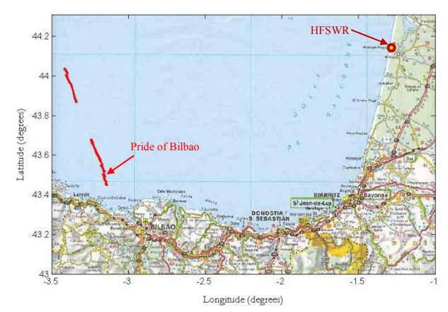
Figure 2. Tracking of the Pride of Bilbao ferry.

The Automatic Identification System (AIS) is principally used for identifying and locating vessels. Vessels can send and receive via AIS transponder their identification, position, course, and speed. AIS communications are located in the VHF-band. So, the coverage is limited by the radio horizon and antennas must be placed as high as possible. Nevertheless, it is estimated that more than 40,000 ships use AIS equipments.