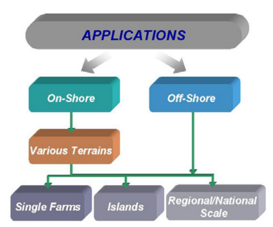
Fig. 2: A wide range of on-line applications is planned for detailed evaluation and optimal exploitation of the results.

requirements. A potential user will be able to select the most appropriate ones and tailor the prediction platform to a specific application. Potential users of the platform can be IPPs, Energy Service Providers that may use the platform as a Prediction Service; utilities, TSOs, DSOs and others.