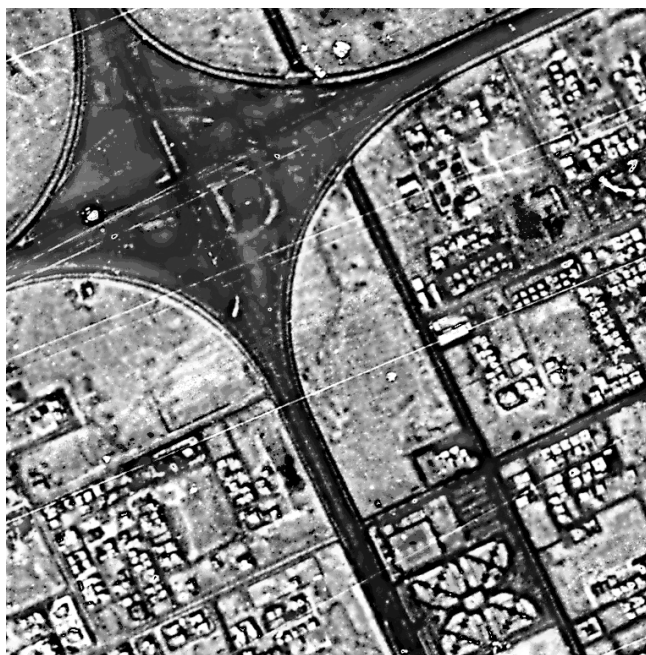
Fig. 4. Resulting image obtained from the ARSIS method