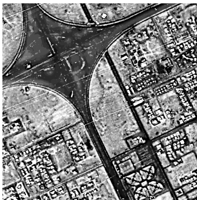
Fig. 4. Resulting image obtained from the ARSIS method