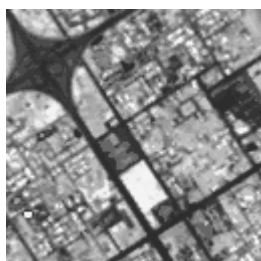
Fig. 2. XS original composition

The big crossroads at the upper left corner of image is of interest. One can see that the resulting image provided by the ARSIS method is close to the XS original composition than the resulting image of the IHS method. Due to the gap of resolution between the XS and the KVR images, it is difficult to propose a method to quantitatively estimated the resulting images. Even if the geometrical quality of both images seems to be very close, the images resulting from the ARSIS method allows to see all the roads on the crossroads even the lower left loop which exists and is also represented in the original images. Hence the images resulting provided by ARSIS where preferred for the urban mapping.