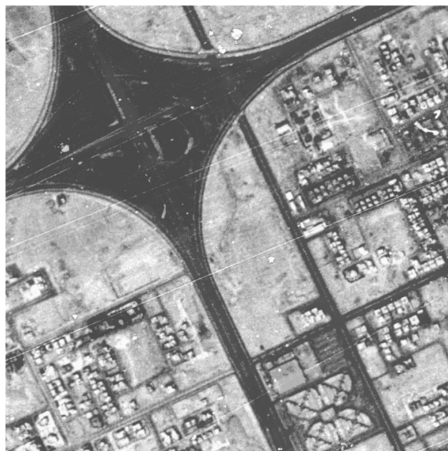
Fig. 3. Resulting image obtained from the IHS method