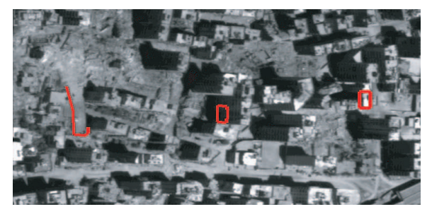
(b) Crisis image (9 August 2006)