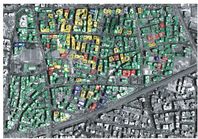
Figure 2: Area of Haret Hreik, in Beirut, Lebanon. Image acquired in 19 June 2006 (reference image). The footprints of the 430 buildings contained in the GIS, used as additional input, is overlaid. The green corresponds to intact or not detectable damage (325 buildings); the yellow to buildings destroyed between the 19 June 2006 and the 22 July 2006 (74 buildings); the red to buildings destroyed between the 22 July 2006 and the 9 August 2006 (21 buildings); the blue is for buildings destroyed between the 9 August and the 12 August 2006 (10 buildings).

Figure 1: In red, three marks are drawn in (a): on the ground (left), on the roof of a high building (centre) and on the roof of a low building (right). They are reported in the crisis images (b and c) using the geographical coordinates. The mark on the ground (left) is correctly registered for both crisis images, whereas the buildings roofs are shifted. – Note in (b) that the low building on the right is hidden by another one.