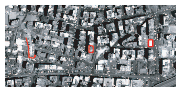
(a) Reference image (19 June 2006)