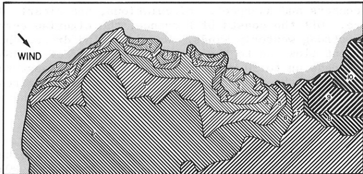
Fig. 1: The mean sea surface temperature distribution during upwelling in the Gulf of Lions, computed from the sum of 15 infrared satellite views. Isotherm interval is 0.5°C. Note the six cold source-points (marked 1 or 2).

Among the hundred views of the area in our hands, about half